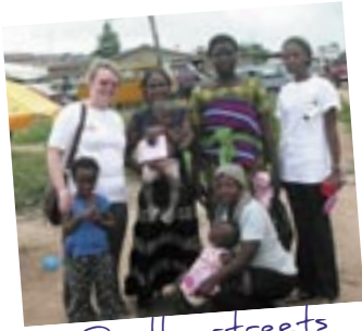
On the streets of Alagbada with breast awareness