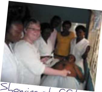
Showing staff how to use a fetal sonic aid (donated) to hear heart beat